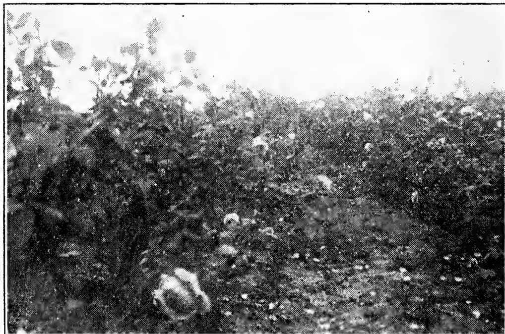
Red Radiance in bloom — 2 year size

McGredy's Scarlet — Brilliant velvety scarlet, orange base.